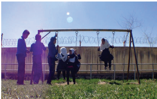
Children playing on swings at the school